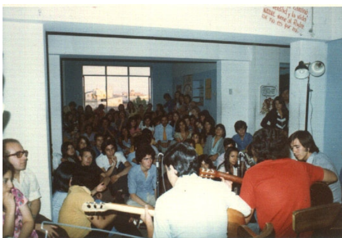
An evangelistic student meeting in 1971