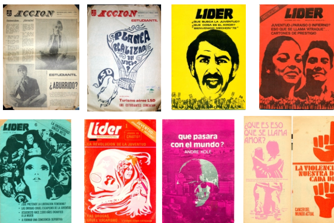
Original evangelistic materials produced in Chile 1970-76